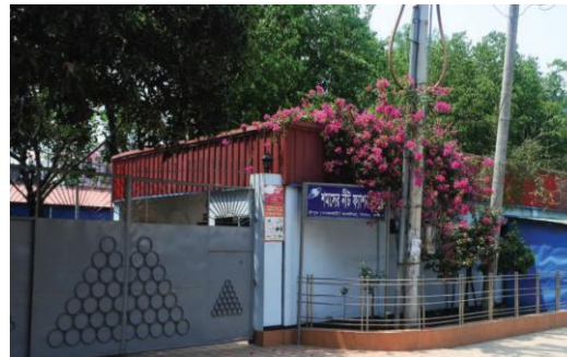
SHAMSHER KNIT FASHIONS LTD