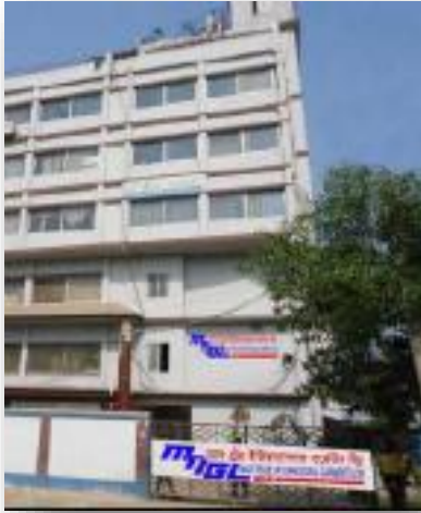
MAS TRADE INTL.