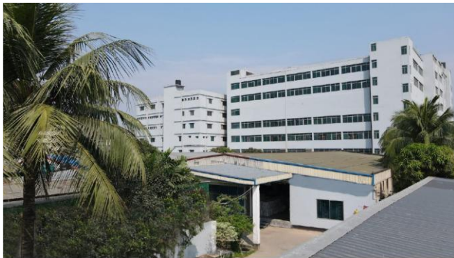
NEXUS FASHION LTD