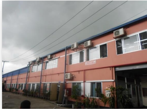
ALEYA APPARELS BD